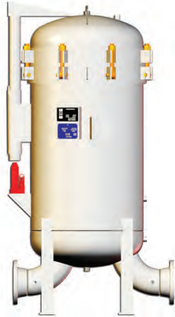
V Series Filter-Coalescer/Separator