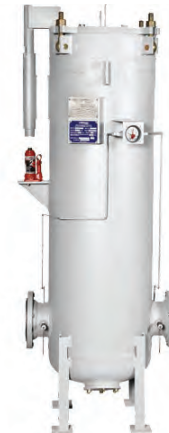
VF Series (for AD-6)