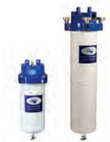
VF-61 & VF-62 (for AD-5)