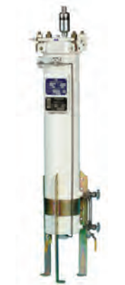
Vel-Max® (for AD-6)