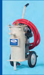
MP5 (#1535) MP1EG (#1721) MP5E (#1661)