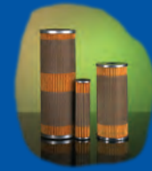
Aquacon® - Industrial (#1582)