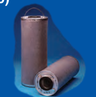
Adsorbent LA-6xx (#1667)