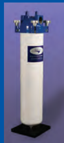
VF-62 (#2105) VF-61 (#2105) VF-609 (#1804) VF-31E (#1597)