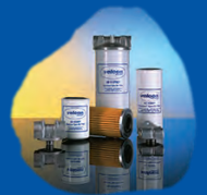
Aquacon® Spin-on Industrial (#1717)