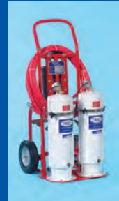
MCP5E/MDP5E (#1691) AVF (#2023) HP10/HP30 (#1604)