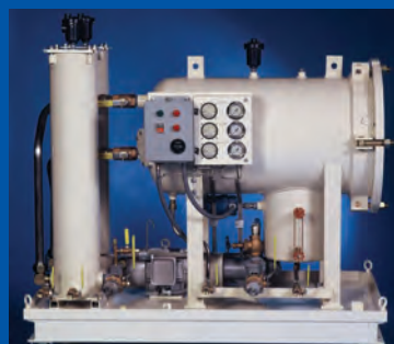
TOC30 (#1751) TOC5 (#1857) HCP/HDP (#1693)