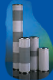
Synthetic FOS (#1734)